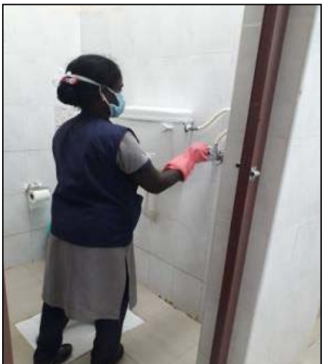
PPEs while conducting cleaning